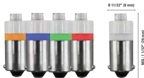
T-3 1/4 - Single chip