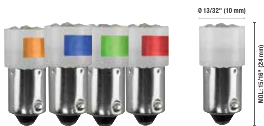
T-3 1/4 - 7 Cluster