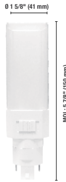
Horizontal 9 W 3 CCT