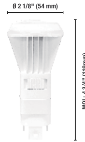
Vertical 9 W 3 CCT