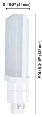
Horizontal 13 W