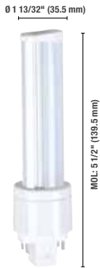
Horizontal 6 W