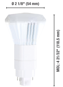
Vertical 13 W