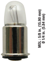
MOL: 5/8 in. (15.90 mm) Ø 1/4 in. (5.84 mm)