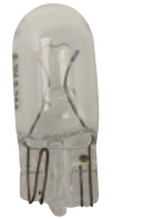
MOL: 1 3/16 in. (27 mm) Ø 7/16 in. (10.30 mm)