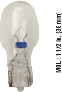
MOL: 1 1/2 in. (38 mm) Ø 5/8 in. (15.90 mm)