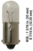
MOL: 1 3/16 in. (30 mm) Ø 7/16 in. (10.30 mm)