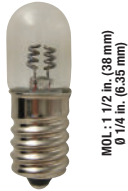
MOL: 1 1/2 in. (38 mm) Ø 1/4 in. (6.35 mm)