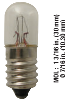
MOL: 1 3/16 in. (30 mm) Ø 7/16 in. (10.30 mm)