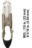
MOL: 7/8 in. (22 mm) Ø 3/16 in. (4.80 mm)