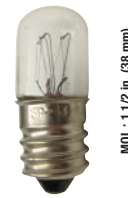
MOL: 1 1/2 in. (38 mm) Ø 1/4 in. (6.35 mm)