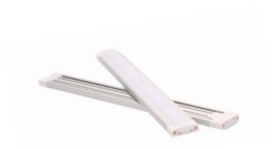
24V Armonia TM LED Bars