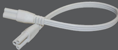
Linkable cable connectors (12", 48", 72", 96")